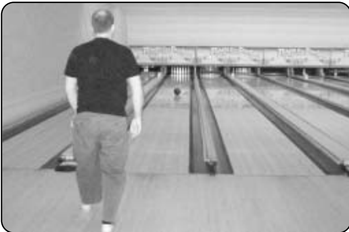
You can shorten my legs and give me a bald patch but that's looking like a strike to me!