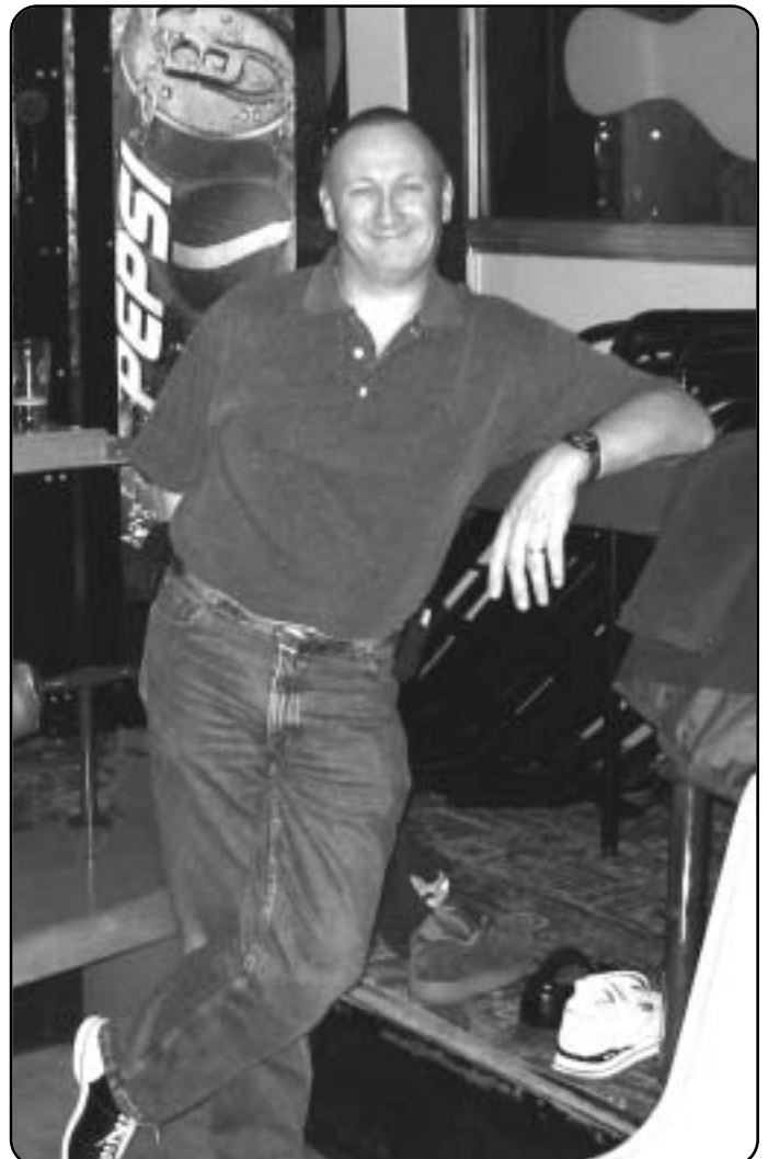
Shirt £15, Jeans £30, smug grin – priceless!