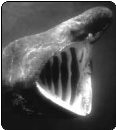
Another UK sighting, the basking shark