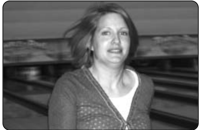
If it's not looking good – run away fast!