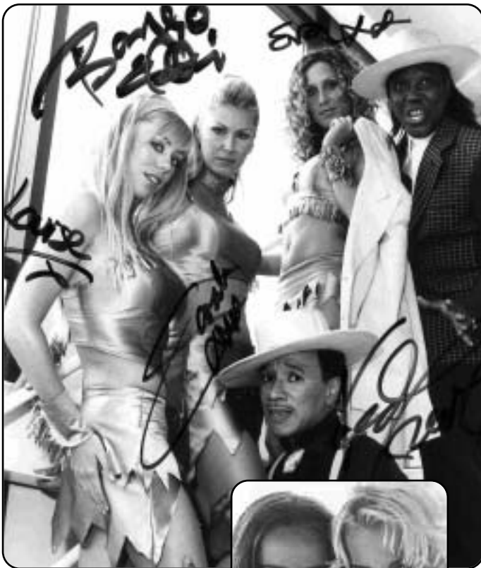
Kid Creole and the Coconuts and Bananarama were the weekends highlights.