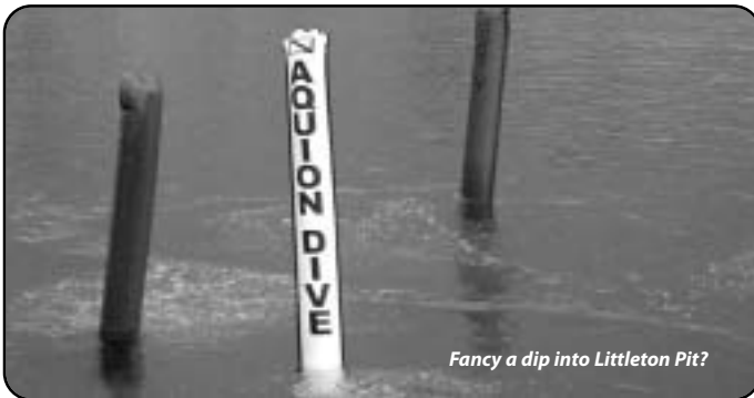
Fancy a dip into Littleton Pit?

Of course, some of you bravehardy souls have already ventured into open water during the winter and spring, but for the majority of us the season is just opening.