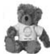
Teddy Bear, wearing a club T-Shirt!