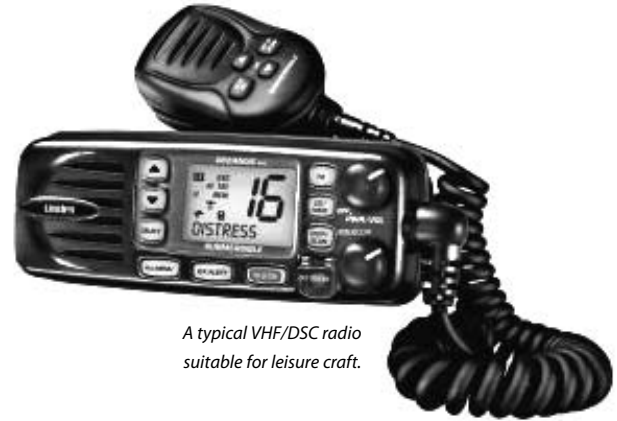
A typical VHF/DSC radio suitable for leisure craft.

VHF frequencies between 156.000MHz and 174.000MHz are allocated to the Maritime Mobile Service (MMS); that is, for use by ships fitted with VHF radio. The band is divided in 59 channels and Channel 16 has always been the VHF Distress Safety and Calling frequency. GMDSS was