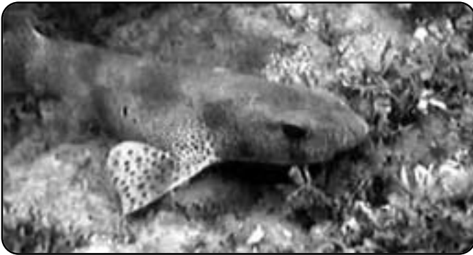
Dogfish are sharks and are common in UK waters.